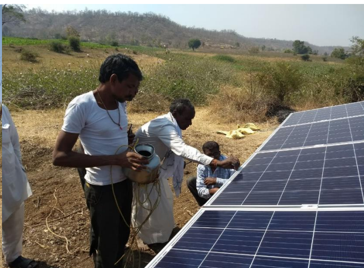
People celebrating and conducting Pooja for the new system