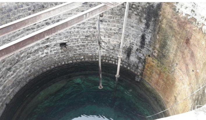
Water source : Open well