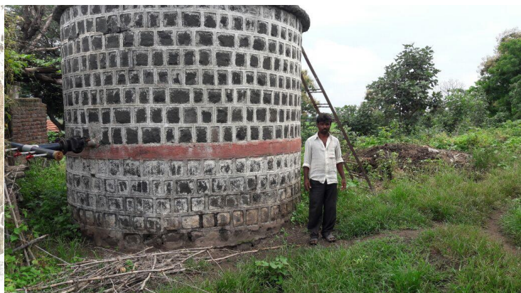
Water storage tank