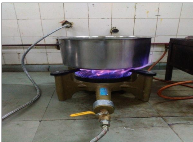
Commercial biogas burner