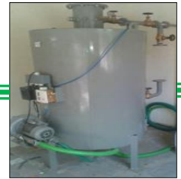
H 2 S Scrubber & Pressure Regulating System