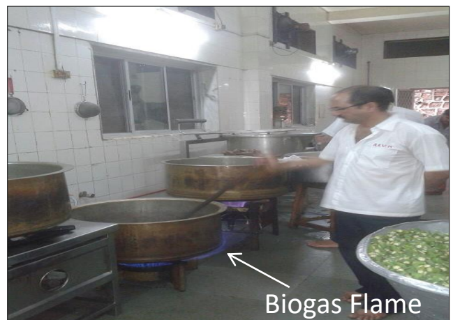
Cooking on biogas burner at Canteen

Three commercial biogas burners are used at canteen of school. Daily 40-50 cubic meter of biogas is used for cooking breakfast and lunch for nearly 600 students. The biogas used at canteen replaces nearly 400 commercial cylinder per year.