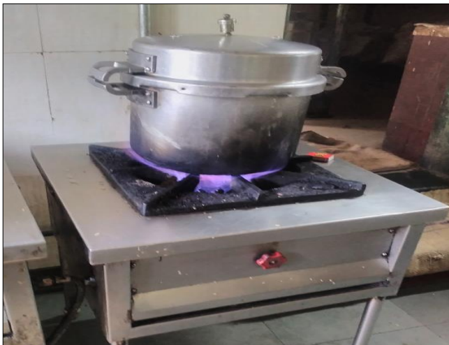
Commercial biogas burner