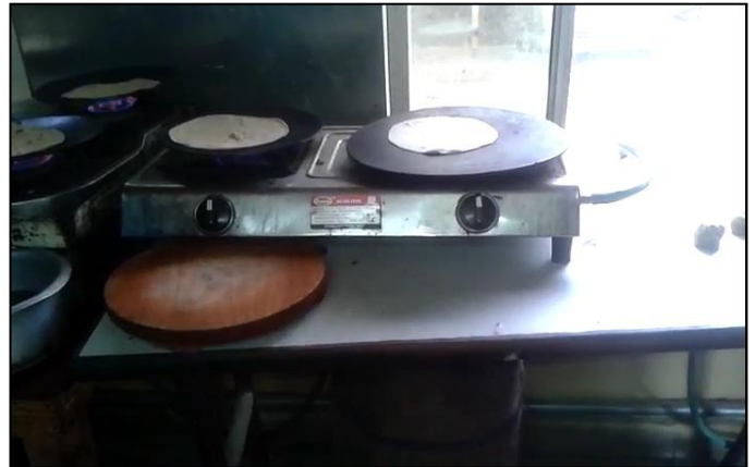
Domestic biogas burner