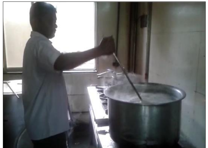
Cooking on biogas burner at Canteen

Two biogas canteen burners are used at company canteen. 40% of daily cooking fuel requirement is replaced satisfactorily with biogas from the available waste.